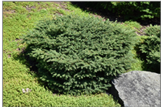
Nest Spruce