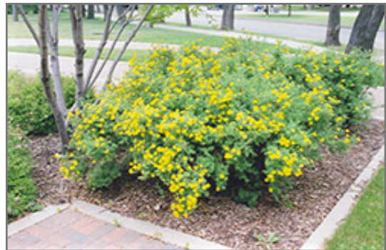
Coronation Triumph Potentilla in bloom