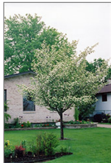
Snowbird Hawthorn in bloom