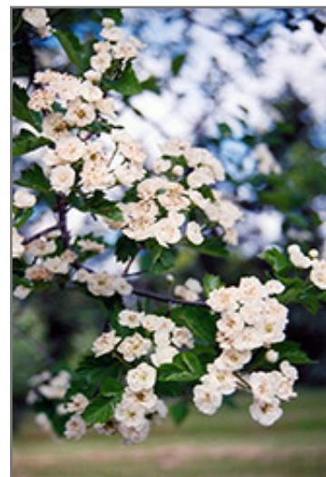
Snowbird Hawthorn flowers