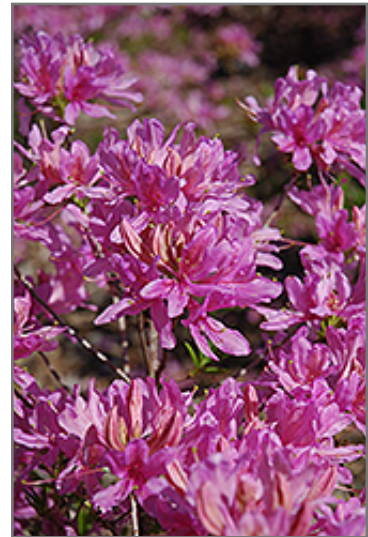
Orchid Lights Azalea flowers

Orchid Lights Azalea is recommended for the following landscape applications;