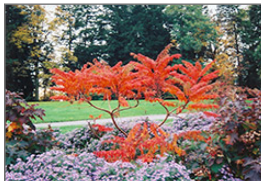
Cutleaf Sumac in fall