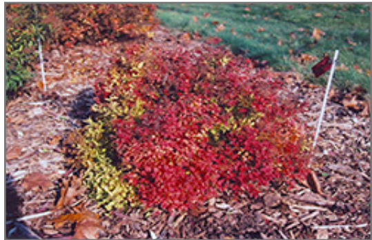
Dakota Goldcharm Spirea in fall

This shrub should only be grown in full sunlight. It prefers to grow in average to moist conditions, and shouldn't be allowed to dry out. It is not particular as to soil type or pH. It is highly tolerant of urban pollution and will even thrive in inner city environments. This is a selected variety of a species not originally from North America.