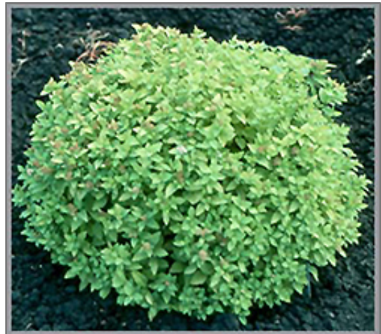
Dakota Goldcharm Spirea