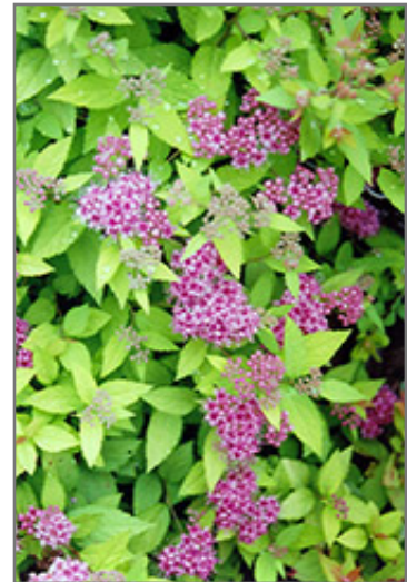
Dakota Goldcharm Spirea flowers

Dakota Goldcharm Spirea is a multi-stemmed deciduous shrub with a more or less rounded form. Its relatively fine texture sets it apart from other landscape plants with less refined foliage.