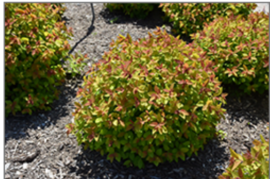
Double Play Big Bang Spirea