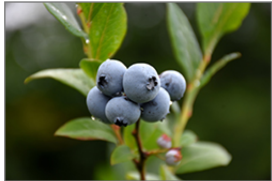
Northsky Blueberry fruit