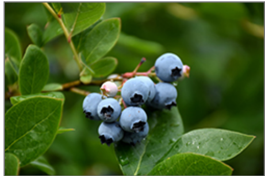
Northcountry Blueberry fruit