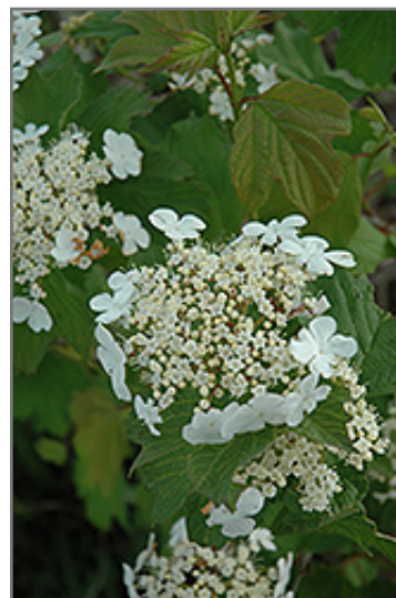
Wentworth Cranberry flowers

Wentworth Cranberry is a multi-stemmed deciduous shrub with an upright spreading habit of growth. Its average texture blends into the landscape, but can be balanced by one or two finer or coarser trees or shrubs for an effective composition.