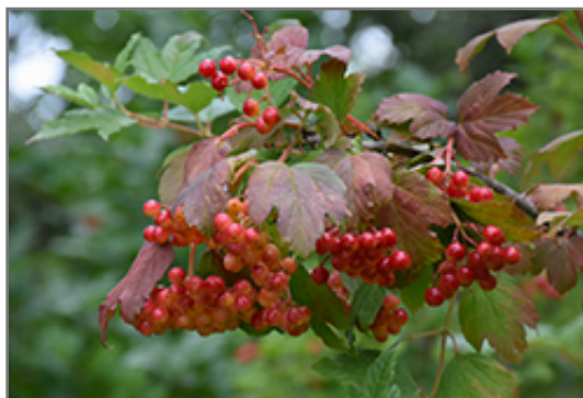
Wentworth Cranberry fruit