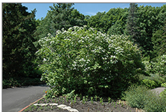
Wentworth Cranberry in bloom