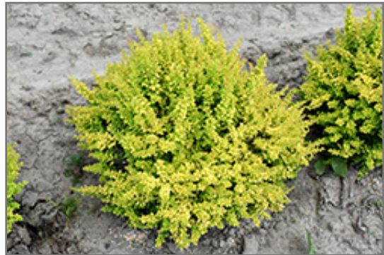
Sunsation Barberry

Sunsation Barberry is a dense multi-stemmed deciduous shrub with a more or less rounded form. Its relatively fine texture sets it apart from other landscape plants with less refined foliage.