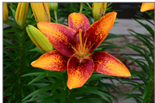
Lily Looks Tiny Orange Sensation Lily flowers