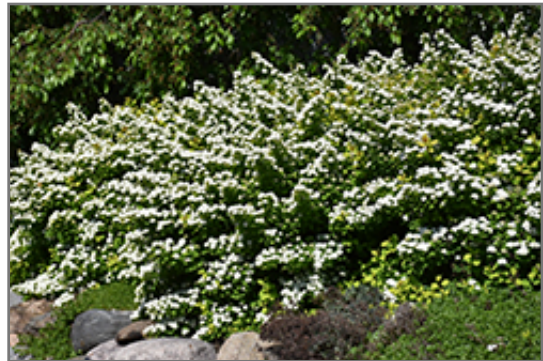
Glow Girl Spirea in bloom

This is a relatively low maintenance shrub, and is best pruned in late winter once the threat of extreme cold has passed. It is a good choice for attracting butterflies to your yard, but is not particularly attractive to deer who tend to leave it alone in favor of tastier treats. It has no significant negative characteristics.