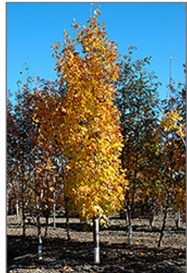
Lord Selkirk Sugar Maple in fall