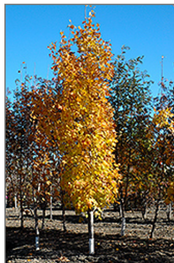
Lord Selkirk Sugar Maple in fall