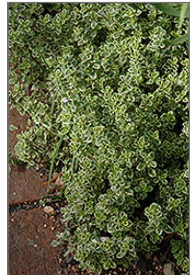
Aureus Lemon Thyme foliage