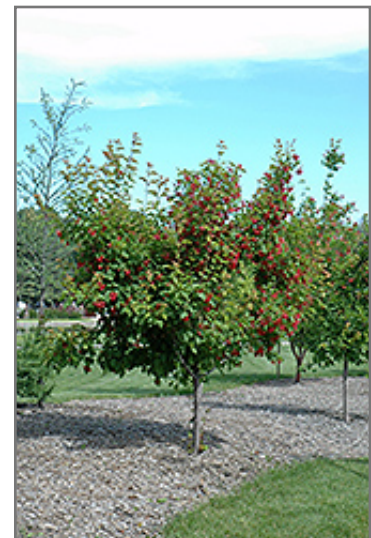
Ruby Slippers Amur Maple