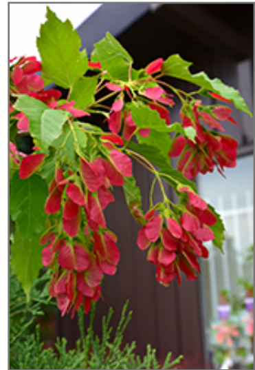
Ruby Slippers Amur Maple fruit