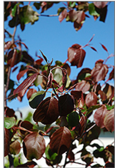
Rudolph Flowering Crab foliage

This tree should only be grown in full sunlight. It prefers to grow in average to moist conditions, and shouldn't be allowed to dry out. It is not particular as to soil type or pH. It is highly tolerant of urban pollution and will even thrive in inner city environments. This particular variety is an interspecific hybrid.