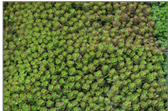
Dragon's Blood Stonecrop foliage