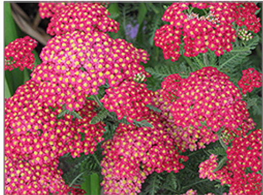
Galaxy Paprika Yarrow flowers