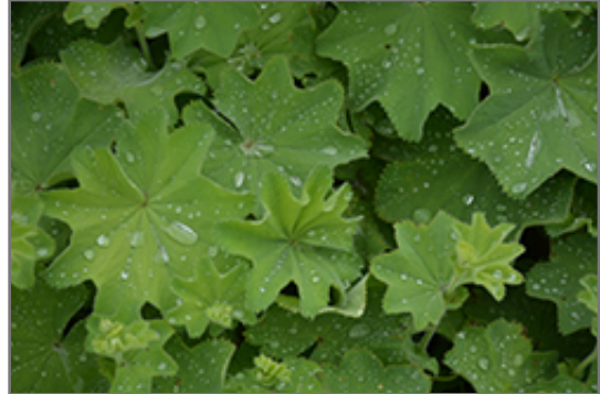
Lady's Mantle foliage

This plant performs well in both full sun and full shade. It is very adaptable to both dry and moist locations, and should do just fine under typical garden conditions. It is not particular as to soil type or pH. It is highly tolerant of urban pollution and will even thrive in inner city environments. This species is not originally from North America. It can be propagated by cuttings.