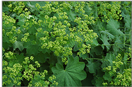
Lady's Mantle flowers

Lady's Mantle is recommended for the following landscape applications;