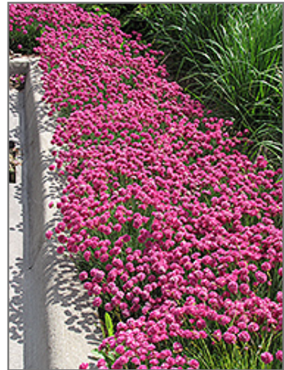
Dusseldorf Pride Sea Thrift in bloom