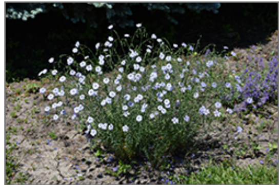
Blue Sapphire Perennial Flax in bloom