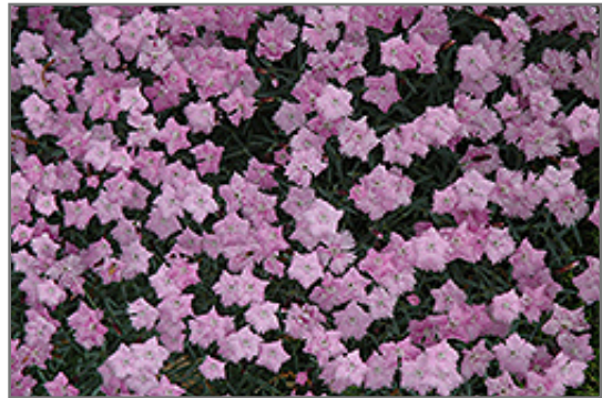
Bath's Pink Pinks in bloom

Bath's Pink Pinks is recommended for the following landscape applications;