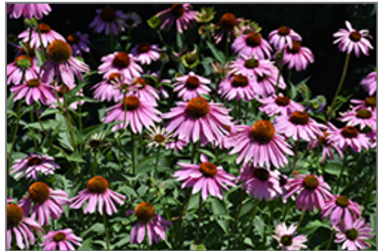
Magnus Coneflower flowers

Magnus Coneflower is a fine choice for the garden, but it is also a good selection for planting in outdoor pots and containers. With its upright habit of growth, it is best suited for use as a 'thriller' in the 'spiller-thriller-filler' container combination; plant it near the center of the pot, surrounded by smaller plants and those that spill over the edges. It is even sizeable enough that it can be grown alone in a suitable container. Note that when growing plants in outdoor containers and baskets, they may require more frequent waterings than they would in the yard or garden. Be aware that in our climate, most plants cannot be expected to survive the winter if left in containers outdoors, and this plant is no exception. Contact our experts for more information on how to protect it over the winter months.