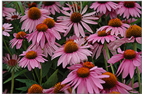
Magnus Coneflower flowers

Magnus Coneflower is an herbaceous perennial with an upright spreading habit of growth. Its medium texture blends into the garden, but can always be balanced by a couple of finer or coarser plants for an effective composition.