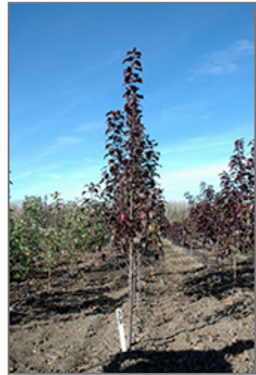
Royal Mist Flowering Crab

This tree should only be grown in full sunlight. It prefers to grow in average to moist conditions, and shouldn't be allowed to dry out. It is not particular as to soil type or pH. It is highly tolerant of urban pollution and will even thrive in inner city environments. This particular variety is an interspecific hybrid.