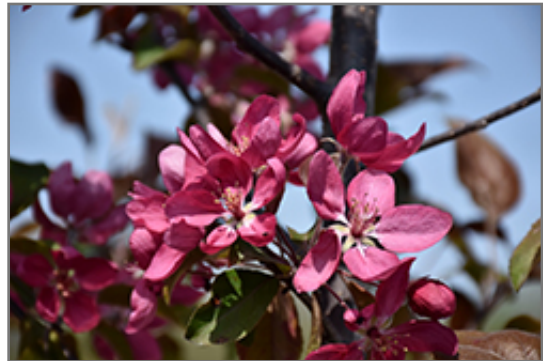
Royal Mist Flowering Crab flowers

Royal Mist Flowering Crab is a dense deciduous tree with a shapely oval form. Its average texture blends into the landscape, but can be balanced by one or two finer or coarser trees or shrubs for an effective composition.