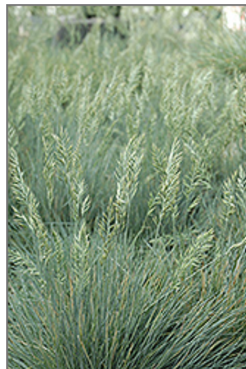
Elijah Blue Fescue foliage