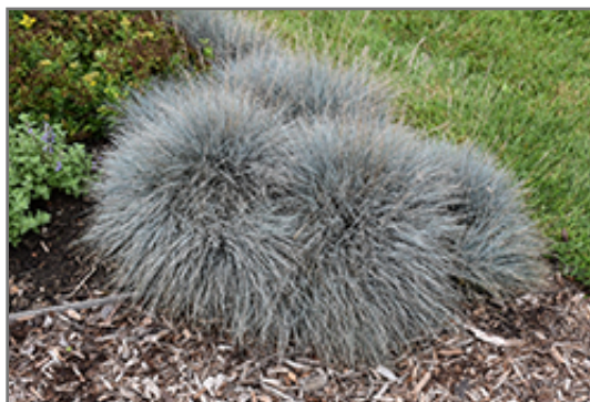
Elijah Blue Fescue

Elijah Blue Fescue will grow to be about 8 inches tall at maturity, with a spread of 12 inches. Its foliage tends to remain low and dense right to the ground. It grows at a medium rate, and under ideal conditions can be expected to live for approximately 8 years. As an evergreen perennial, this plant will typically keep its form and foliage year-round.