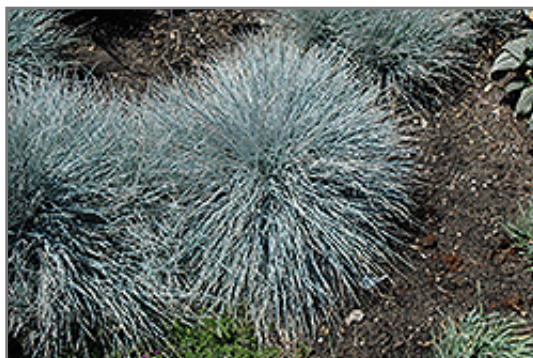
Elijah Blue Fescue

Elijah Blue Fescue is recommended for the following landscape applications;