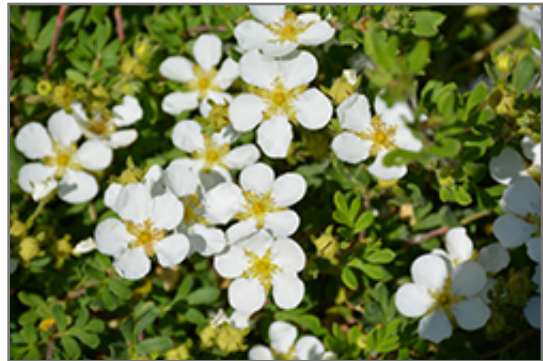
Happy Face White Potentilla flowers