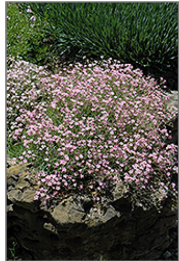
Pink Creeping Baby's Breath in bloom