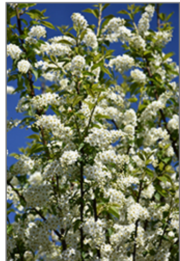
Bailey's Select Schubert Chokecherry flowers