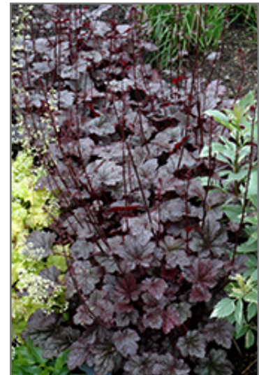
Plum Pudding Coral Bells in bloom