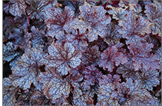
Plum Pudding Coral Bells foliage

Plum Pudding Coral Bells is recommended for the following landscape applications;