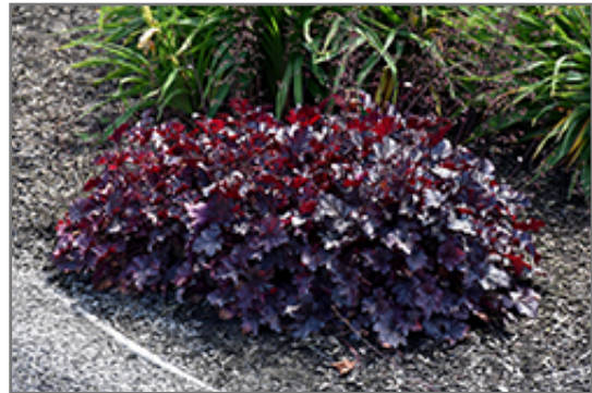
Plum Pudding Coral Bells

This plant is not reliably hardy in our region, and certain restrictions may apply; contact the store for more information.