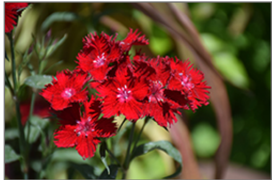
Rockin' Red Pinks flowers

Rockin' Red Pinks is an herbaceous evergreen perennial with a mounded form. It brings an extremely fine and delicate texture to the garden composition and should be used to full effect.