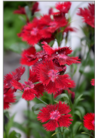
Rockin' Red Pinks flowers