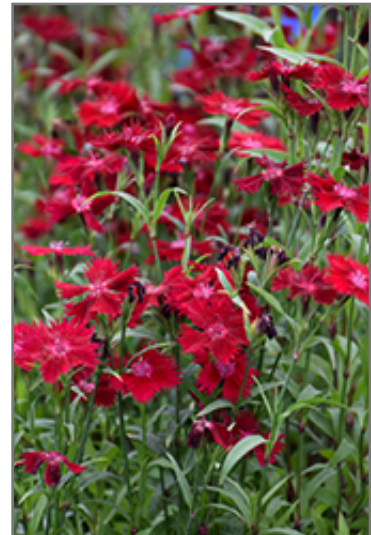
Rockin' Red Pinks flowers