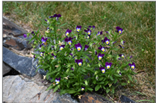
Johnny Jump-Up in bloom

Johnny Jump-Up will grow to be only 4 inches tall at maturity extending to 6 inches tall with the flowers, with a spread of 6 inches. When grown in masses or used as a bedding plant, individual plants should be spaced approximately 5 inches apart. It grows at a fast rate, and tends to be biennial, meaning that it puts on vegetative growth the first year, flowers the second, and then dies. However, this species tends to self-seed and will thereby endure for years in the garden if allowed. As an herbaceous perennial, this plant will usually die back to the crown each winter, and will regrow from the base each spring. Be careful not to disturb the crown in late winter when it may not be readily seen!