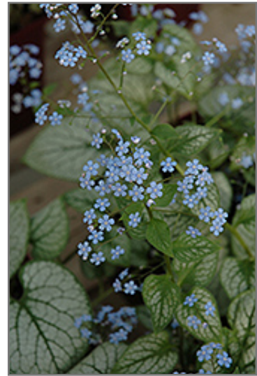
Jack Frost Bugloss flowers

Jack Frost Bugloss is a fine choice for the garden, but it is also a good selection for planting in outdoor pots and containers. It is often used as a 'filler' in the 'spiller-thriller-filler' container combination, providing a mass of flowers and foliage against which the thriller plants stand out. Note that when growing plants in outdoor containers and baskets, they may require more frequent waterings than they would in the yard or garden. Be aware that in our climate, most plants cannot be expected to survive the winter if left in containers outdoors, and this plant is no exception. Contact our store for more information on how to protect it over the winter months.