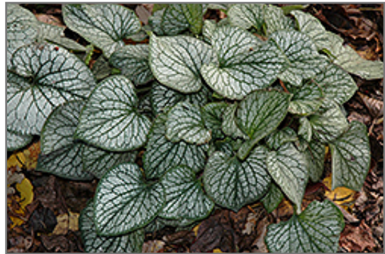
Jack Frost Bugloss