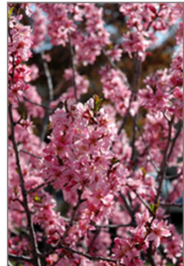
Muckle Plum flowers