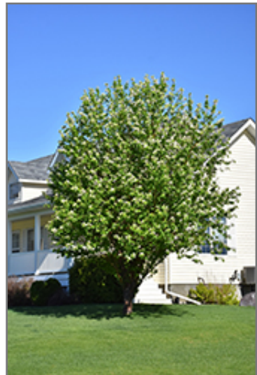
Amur Cherry