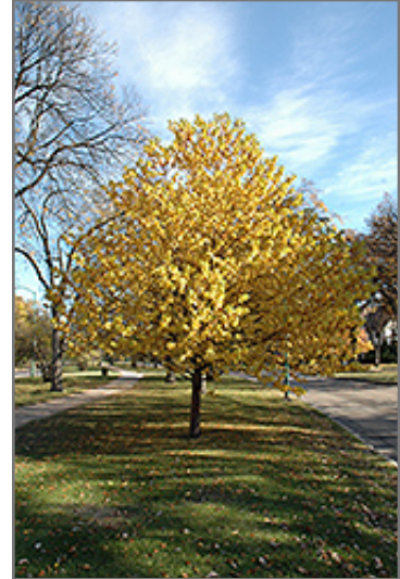
Amur Cherry in fall

* This is a 'special order' plant - contact store for details