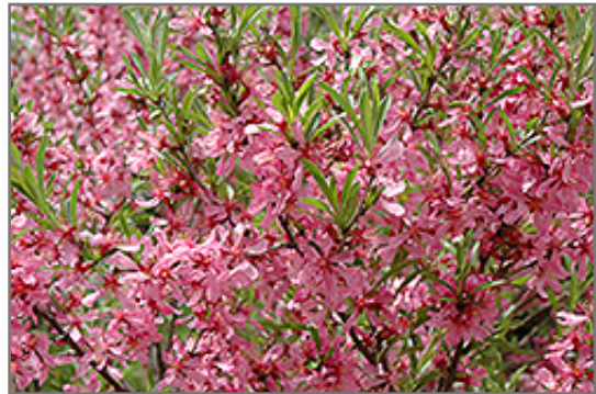
Russian Almond flowers

Russian Almond is recommended for the following landscape applications;