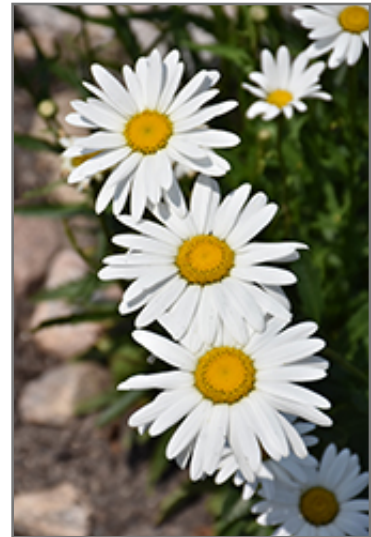
Silver Princess Shasta Daisy flowers