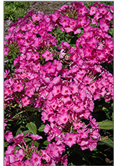
Pink Flame Garden Phlox flowers

Pink Flame Garden Phlox is recommended for the following landscape applications;