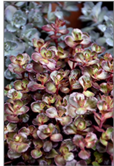
Voodoo Stonecrop foliage

Voodoo Stonecrop is recommended for the following landscape applications;