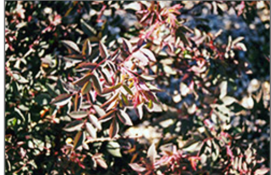
Red Leaf Shrub Rose foliage

This shrub should only be grown in full sunlight. It does best in average to evenly moist conditions, but will not tolerate standing water. It is not particular as to soil type or pH. It is highly tolerant of urban pollution and will even thrive in inner city environments. This species is not originally from North America.