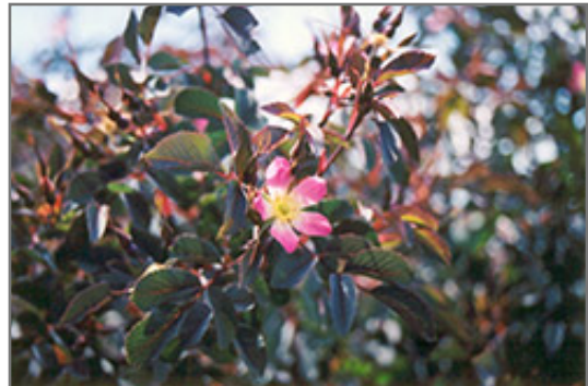
Red Leaf Shrub Rose flowers

Red Leaf Shrub Rose is a multi-stemmed deciduous shrub with a more or less rounded form. Its average texture blends into the landscape, but can be balanced by one or two finer or coarser trees or shrubs for an effective composition.