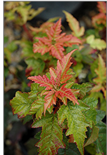
Atomic Amur Maple in fall