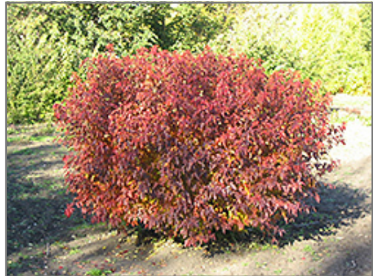
Atomic Amur Maple in fall

This shrub does best in full sun to partial shade. It is very adaptable to both dry and moist locations, and should do just fine under average home landscape conditions. It is not particular as to soil type or pH. It is highly tolerant of urban pollution and will even thrive in inner city environments. This is a selected variety of a species not originally from North America.