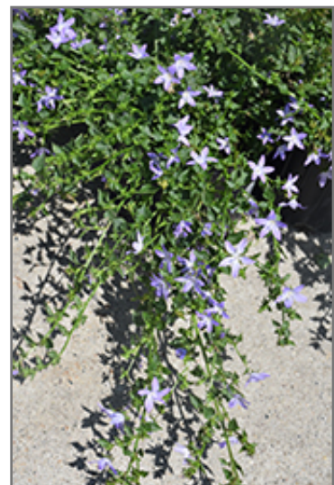
Blue Waterfall Serbian Bellflower in bloom