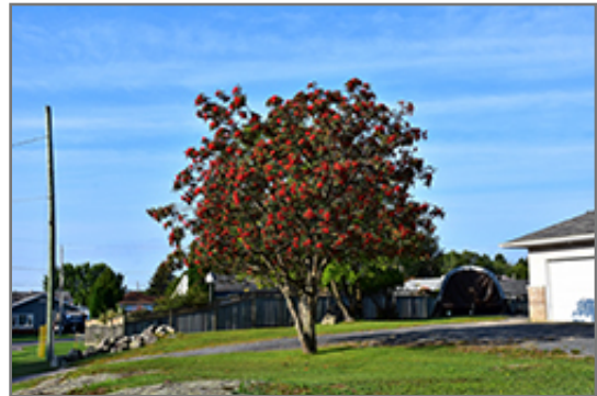
Showy Mountain Ash fruit

Showy Mountain Ash is recommended for the following landscape applications;