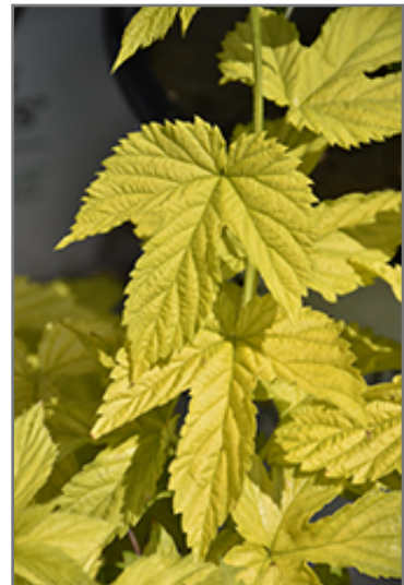
Golden Hops foliage