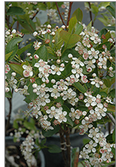
Viking Chokeberry flowers