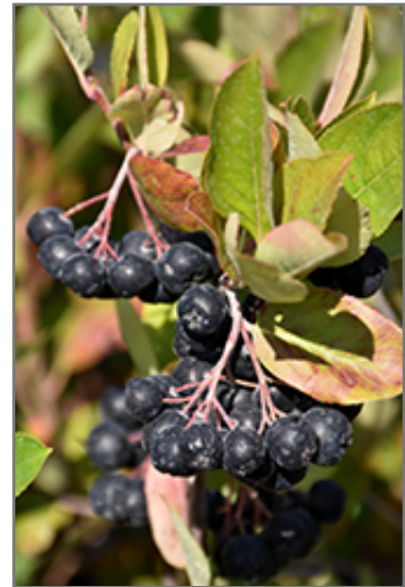
Viking Chokeberry fruit

* This is a 'special order' plant - contact store for details