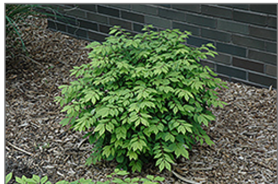
Little Moses Burning Bush