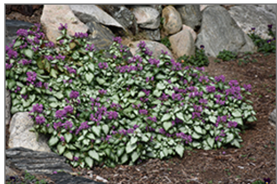
Purple Dragon Spotted Dead Nettle in bloom