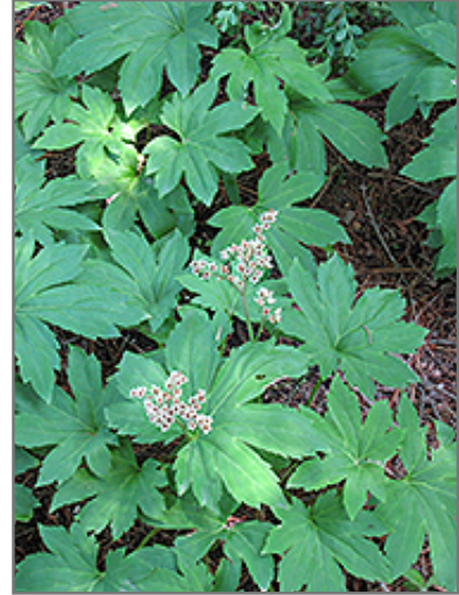
Crimson Fans Mukdenia flowers

Crimson Fans Mukdenia will grow to be about 12 inches tall at maturity extending to 18 inches tall with the flowers, with a spread of 24 inches. When grown in masses or used as a bedding plant, individual plants should be spaced approximately 20 inches apart. Its foliage tends to remain dense right to the ground, not requiring facer plants in front. It grows at a medium rate, and under ideal conditions can be expected to live for approximately 10 years. As an herbaceous perennial, this plant will usually die back to the crown each winter, and will regrow from the base each spring. Be careful not to disturb the crown in late winter when it may not be readily seen!