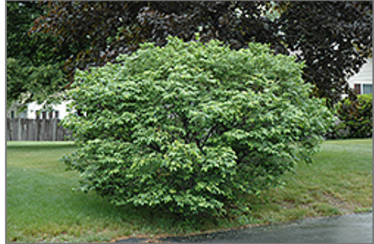
Dwarf Winged Burning Bush

This plant is not reliably hardy in our region, and certain restrictions may apply; contact the store for more information.