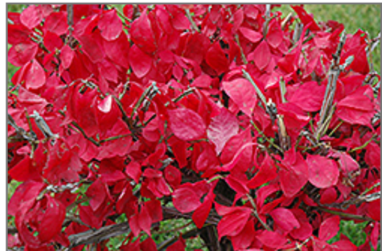
Dwarf Winged Burning Bush in fall