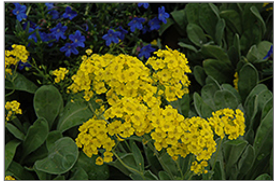
Basket Of Gold Alyssum flowers

This plant will require occasional maintenance and upkeep, and is best cleaned up in early spring before it resumes active growth for the season. It is a good choice for attracting bees and butterflies to your yard, but is not particularly attractive to deer who tend to leave it alone in favor of tastier treats. It has no significant negative characteristics.